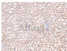
AF8263 at 1/200 staining Rat kidney tissue sections by IHC-P. The tissue was formaldehyde fixed and a heat mediated antigen retrieval step in citrate buffer was performed. The tissue was then blocked and incubated with the Ab for 1.5 hours at 22°C. An HRP conjugated goat anti-rabbit Ab was used as the secondary Ab.

IMPORTANT: For western blot, incubate membrane with diluted primary Ab in 5% w/v milk , 1X TBS, 0.1% Tween@20 at 4°C with gentle shaking, overnight.