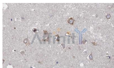
DF8900 at 1/100 staining human brain tissue sections by IHC-P. The tissue was formaldehyde fixed and a heat mediated antigen retrieval step in citrate buffer was performed. The tissue was then blocked and incubated with the Ab for 1.5 hours at 22°C. An HRP conjugated goat anti-rabbit Ab was used as the secondary Ab.

IMPORTANT: For western blot, incubate membrane with diluted primary Ab in 5% w/v milk , 1X TBS, 0.1% Tween@20 at 4°C with gentle shaking, overnight.