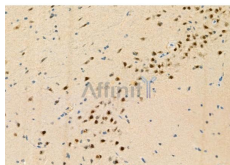
DF9866 at 1/100 staining Rat brain tissue by IHC-P. The sample was formaldehyde fixed and a heat mediated antigen retrieval step in citrate buffer was performed. The sample was then blocked and incubated with the primary Ab at 4°C overnight. An HRP conjugated anti-Rabbit Ab was used as the secondary Ab.

IMPORTANT: For western blot, incubate membrane with diluted primary Ab in 5% w/v milk, 1X TBS, 0.1% Tween@20 at 4°C with gentle shaking, overnight.