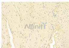
AF7088 at 1/100 staining Mouse heart tissue by IHC-P. The sample was formaldehyde fixed and a heat mediated antigen retrieval step in citrate buffer was performed. The sample was then blocked and incubated with the primary Ab at 4°C overnight. An HRP conjugated anti-Rabbit Ab was used as the secondary Ab.

IMPORTANT: For western blot, incubate membrane with diluted primary Ab in 5% w/v milk, 1X TBS, 0.1% Tween@20 at 4°C with gentle shaking, overnight.