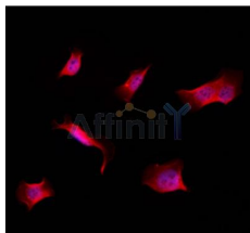
DF3188 staining HeLa by IF/ICC. The sample were fixed with PFA and permeabilized in 0.1% Triton X-100, then blocked in 10% serum for 45 minutes at 25°C. The primary Ab was diluted at 1/200 and incubated with the sample for 1 hour at 37°C. An Alexa Fluor 594 conjugated goat anti-rabbit IgG (H+L) Ab, diluted at 1/600, was used as the secondary Ab.

IMPORTANT: For western blot, incubate membrane with diluted primary Ab in 5% w/v milk, 1X TBS, 0.1% Tween@20 at 4°C with gentle shaking, overnight.