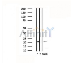
Western blot analysis of extracts from rat spleen, using MYL3 Ab.