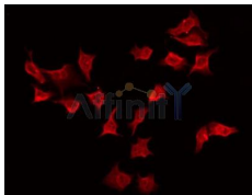
IF/ICC analysis of HepG2 cells, using ATF4 Ab.

IMPORTANT: For western blot, incubate membrane with diluted primary Ab in 5% w/v milk, 1X TBS, 0.1% Tween@20 at 4°C with gentle shaking, overnight.