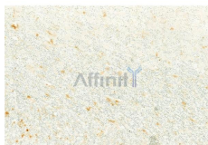
DF6442 at 1/100 staining Rat brain tissue by IHC-P. The sample was formaldehyde fixed and a heat mediated antigen retrieval step in citrate buffer was performed. The sample was then blocked and incubated with the primary Ab at 4°C overnight. An HRP conjugated anti-Rabbit Ab was used as the secondary Ab.

IMPORTANT: For western blot, incubate membrane with diluted primary Ab in 5% w/v milk, 1X TBS, 0.1% Tween@20 at 4°C with gentle shaking,