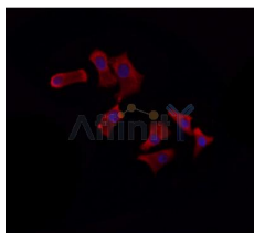
AF9039 staining HepG2 by IF/ICC. The sample were fixed with PFA and permeabilized in 0.1% Triton X-100, then blocked in 10% serum for 45 minutes at 25°C. The primary Ab was diluted at 1/200 and incubated with the sample for 1 hour at 37°C. An Alexa Fluor 594 conjugated goat anti-rabbit IgG (H+L) Ab, diluted at 1/600, was used as the secondary Ab.

IMPORTANT: For western blot, incubate membrane with diluted primary Ab in 5% w/v milk , 1X TBS, 0.1% Tween@20 at 4°C with gentle shaking, overnight.